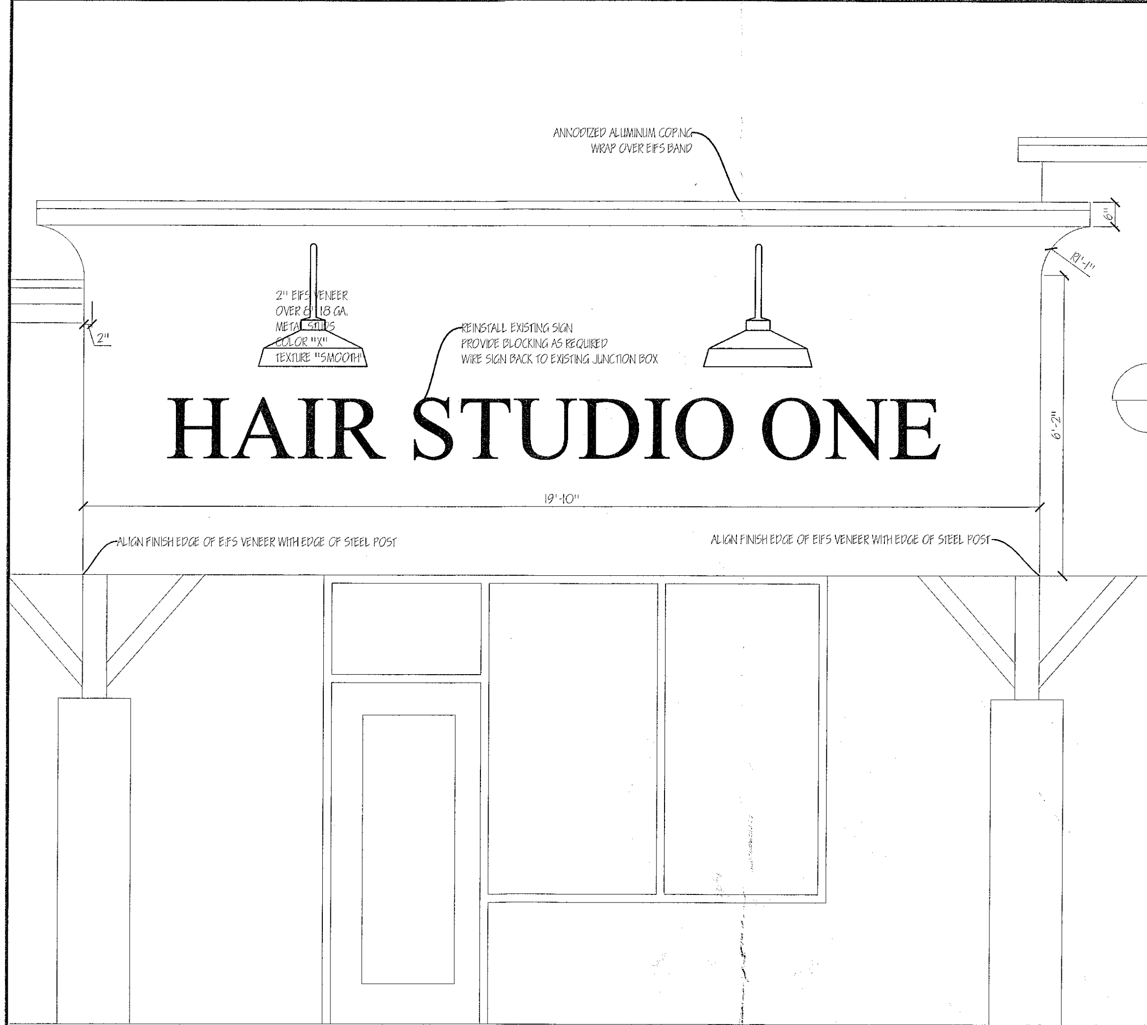
1 FACADE ELEVATION 1/2" = 1'-0"