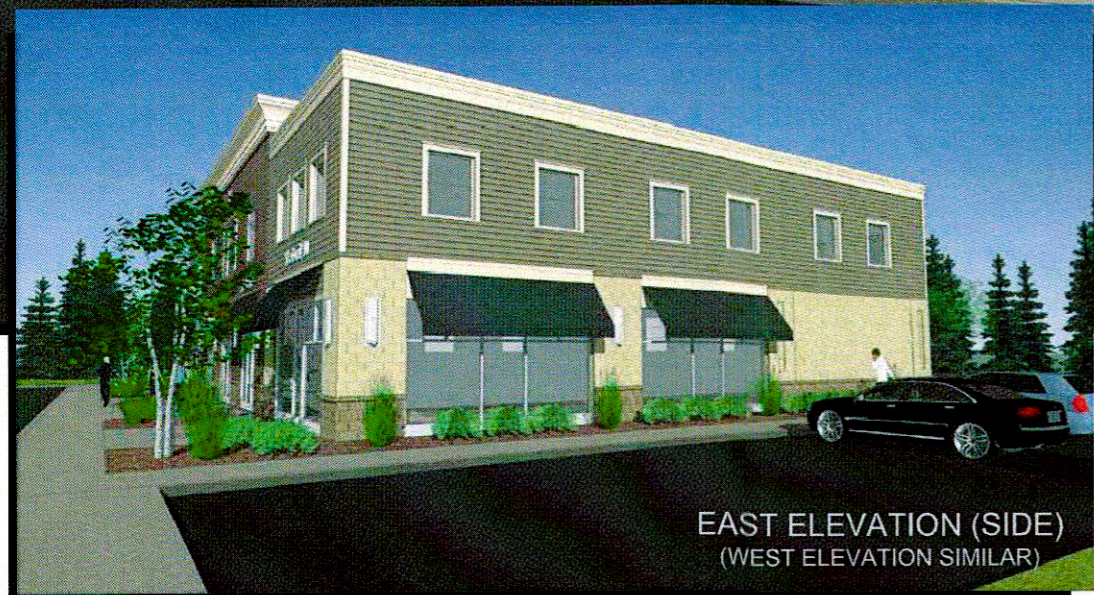
EAST ELEVATION (SIDE) (WEST ELEVATION SIMILAR)