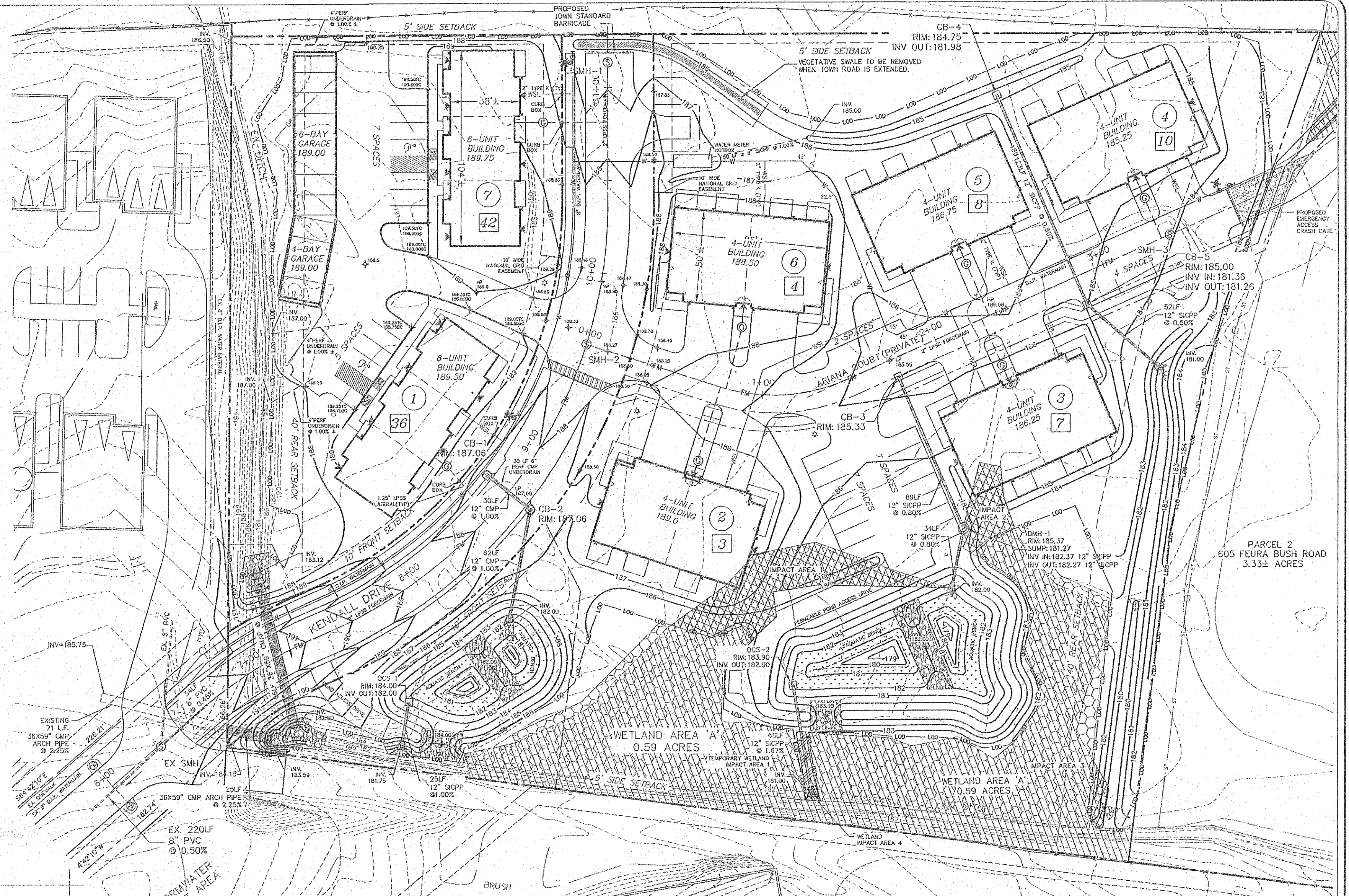
PLAN VIEW SCALE: 1" = 40'