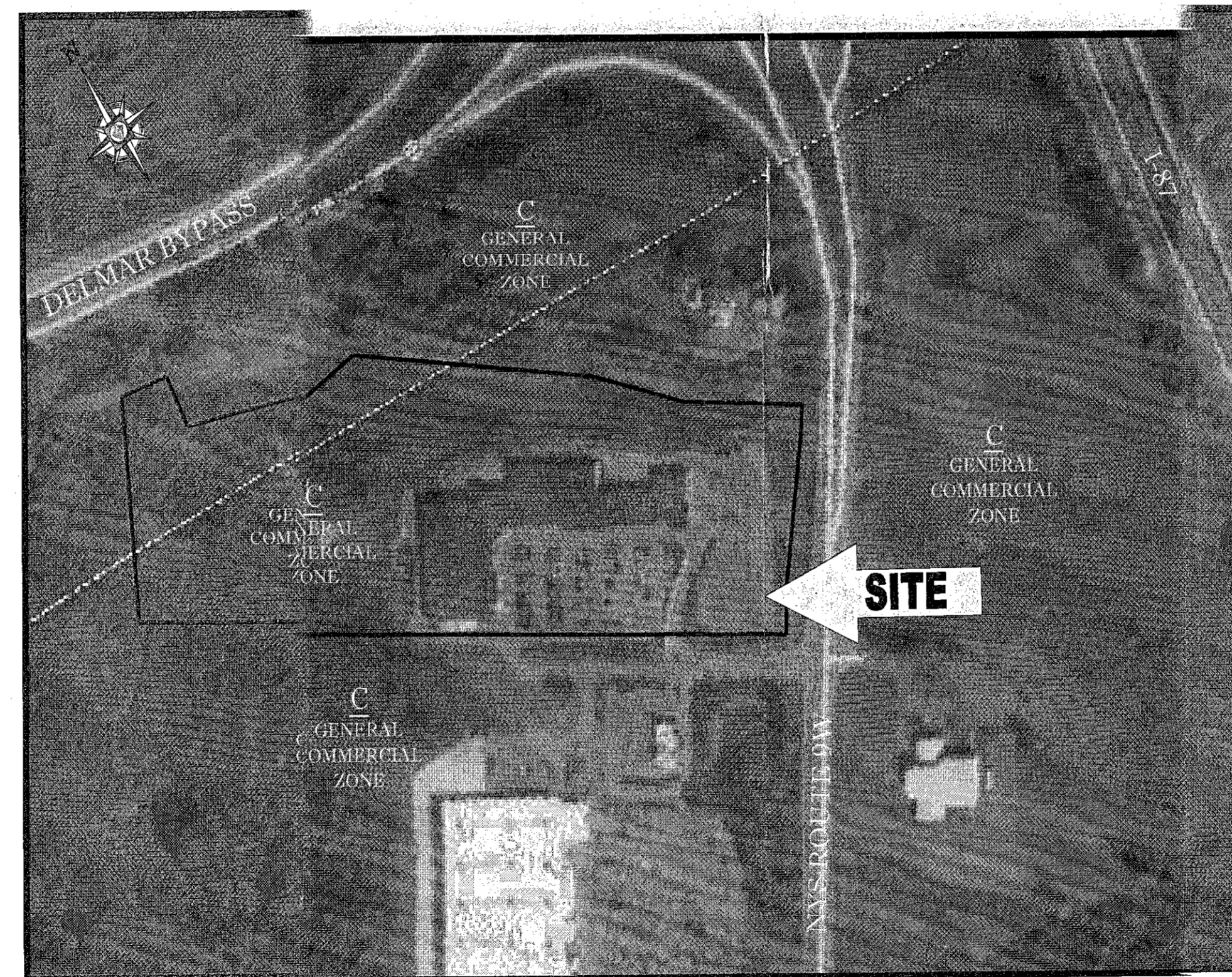
AREA PLAN NOT TO SCALE