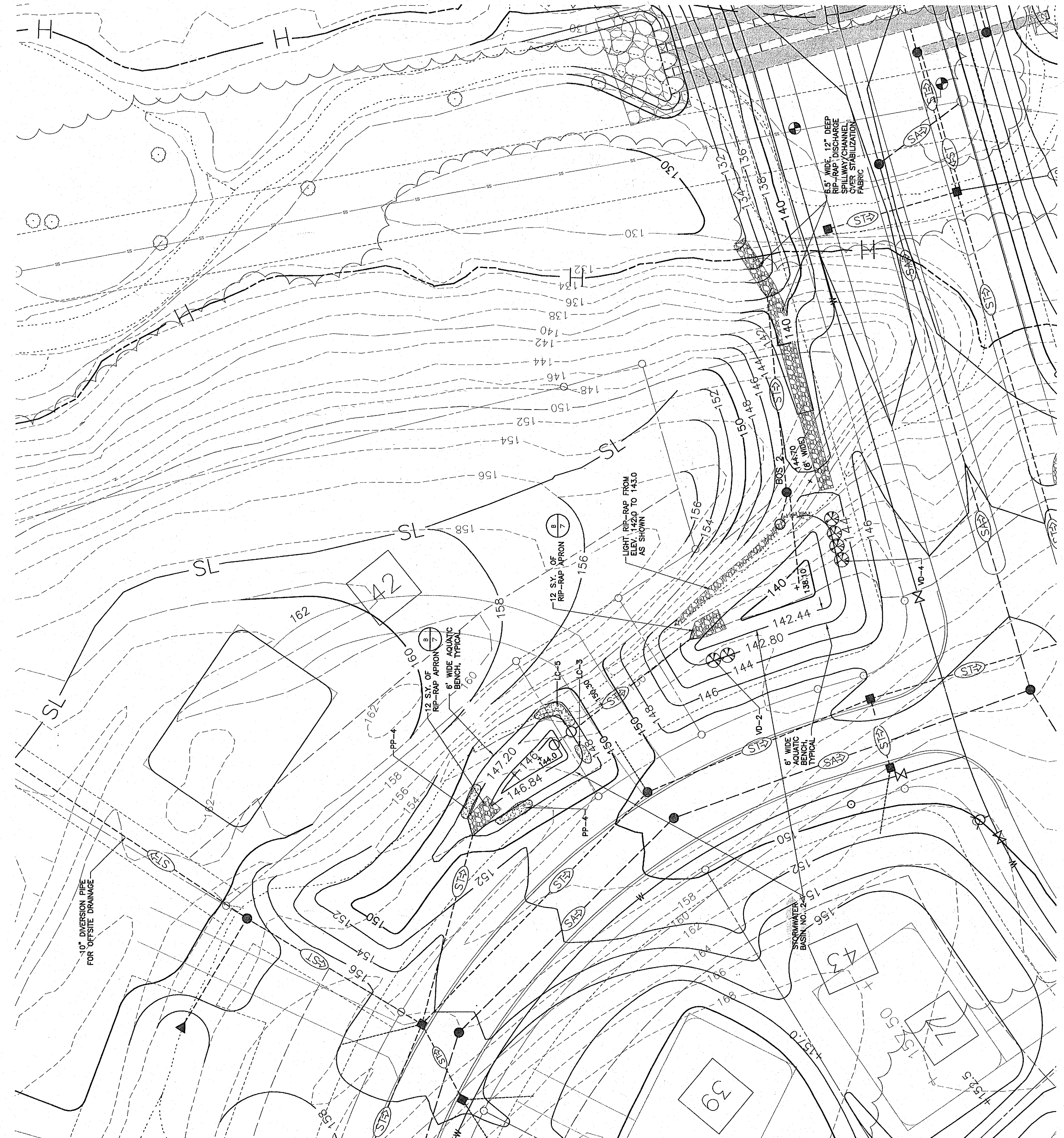
STORMWATER BASIN NO. 2 - PLAN SCALE: 1"=20'

ALBANY COUNTY DEPARTMENT OF HEALTH DIVISION OF ENVIRONMENTAL HEALTH SERVICES By direction of the Commissioner of Health, the plans are hereby approved. See last sheet for date and signature.