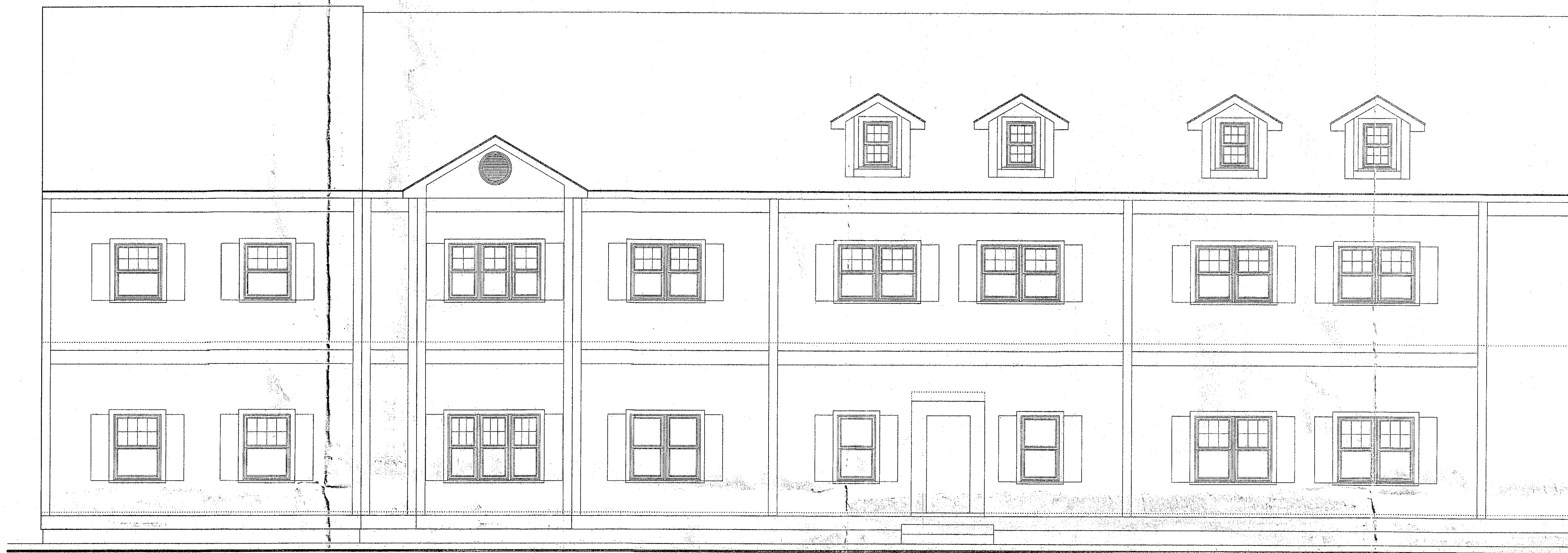
EXISTING FRONT (NORTHWEST) ELEVATION