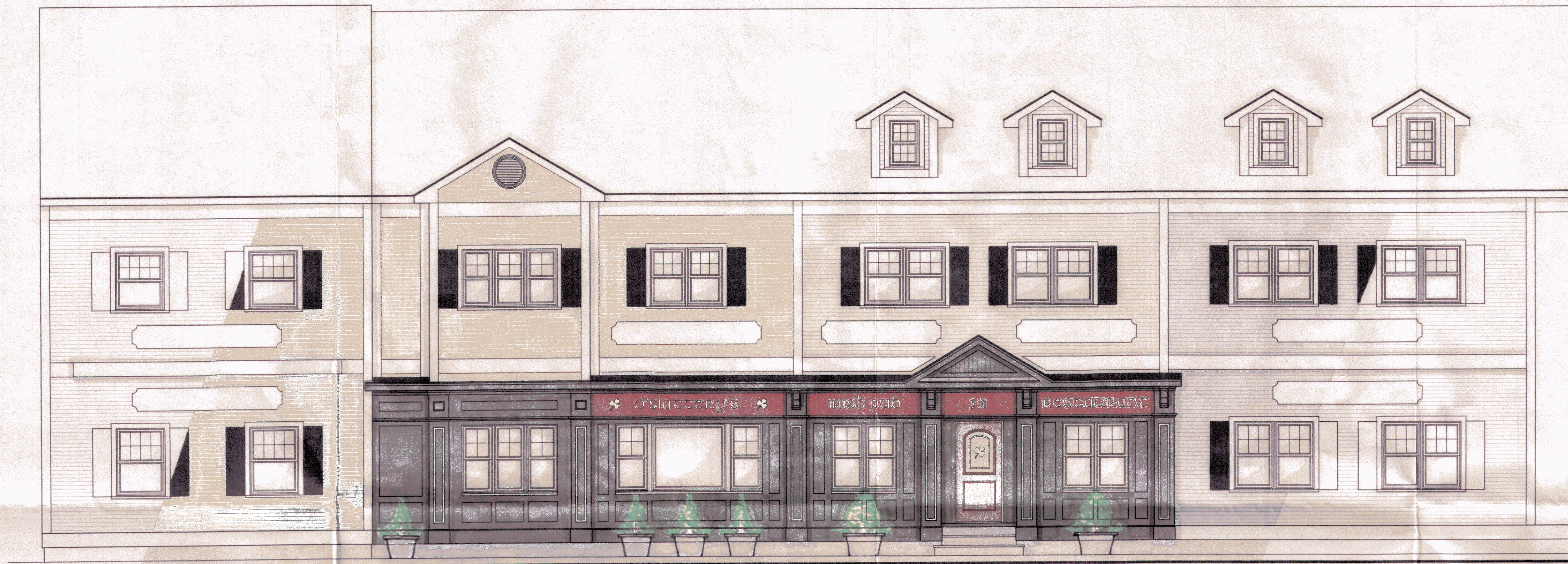
FRONT (NORTHWEST) ELEVATION 1/4"=1'-0"