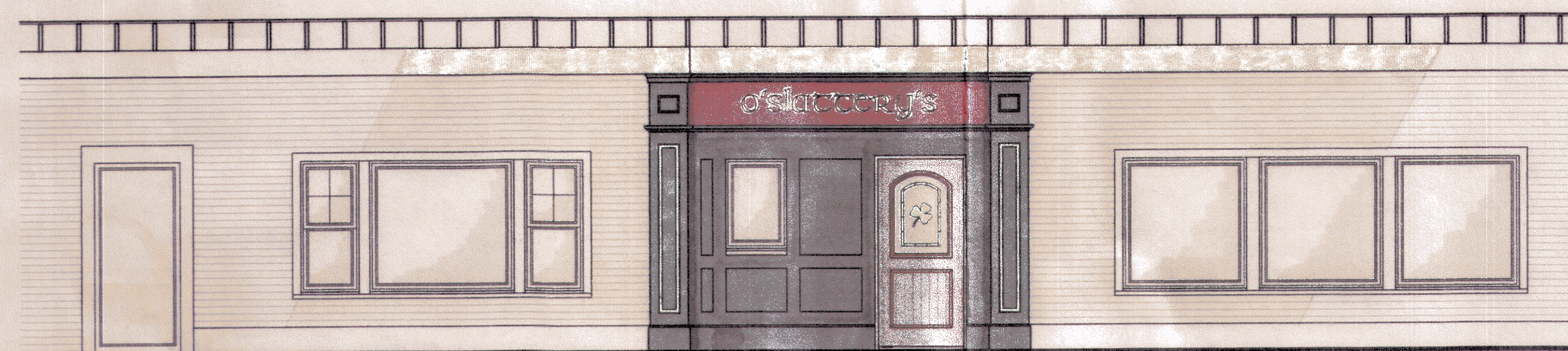
BACK (SOUTHEAST) ELEVATION 1/4"=1'-0"