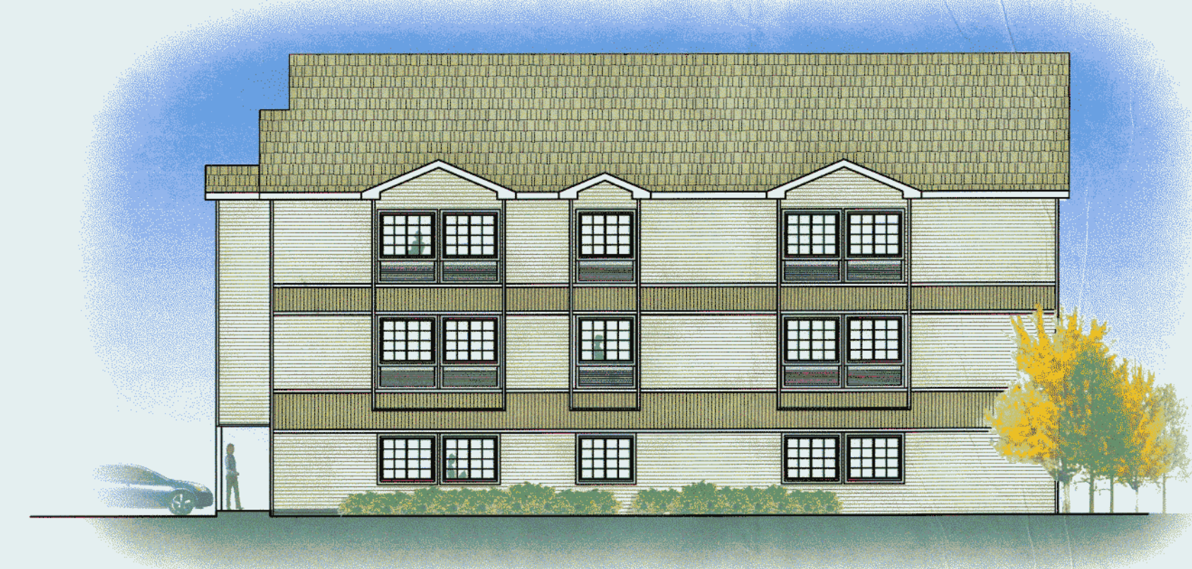
4 SIDE ELEVATION SCALE: 1/8"=1'-0"