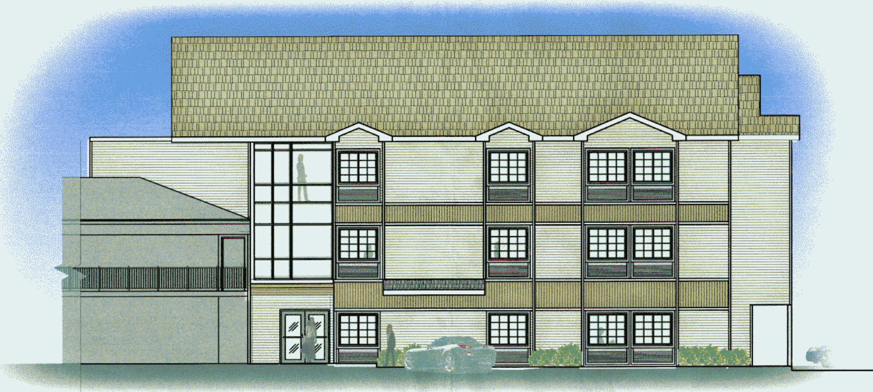
1 SIDE ELEVATION SCALE: 1/8"=1'-0"