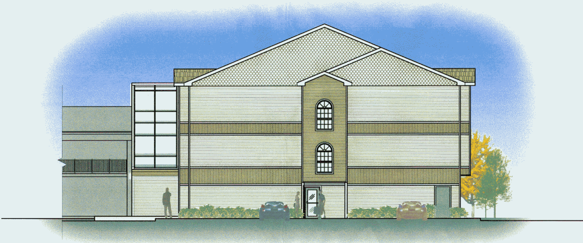
2 FRONT ELEVATION (HANNEY LANE) SCALE: 1/8"=1'-0"