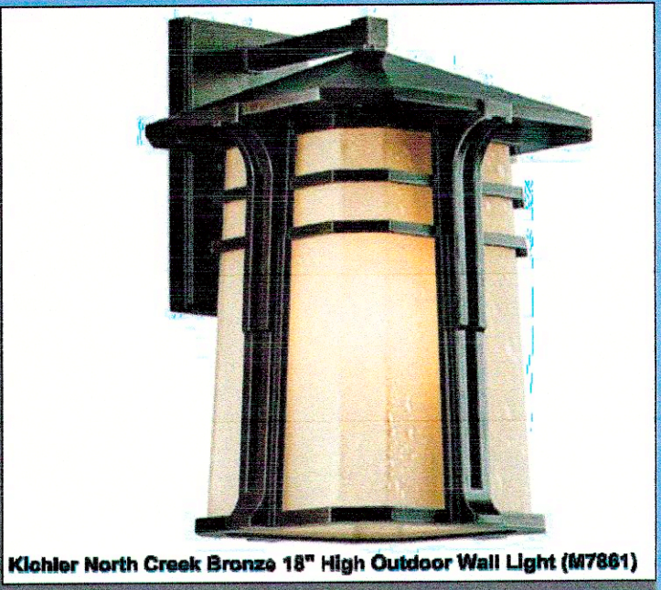
DECORATIVE LIGHT FIXTURES