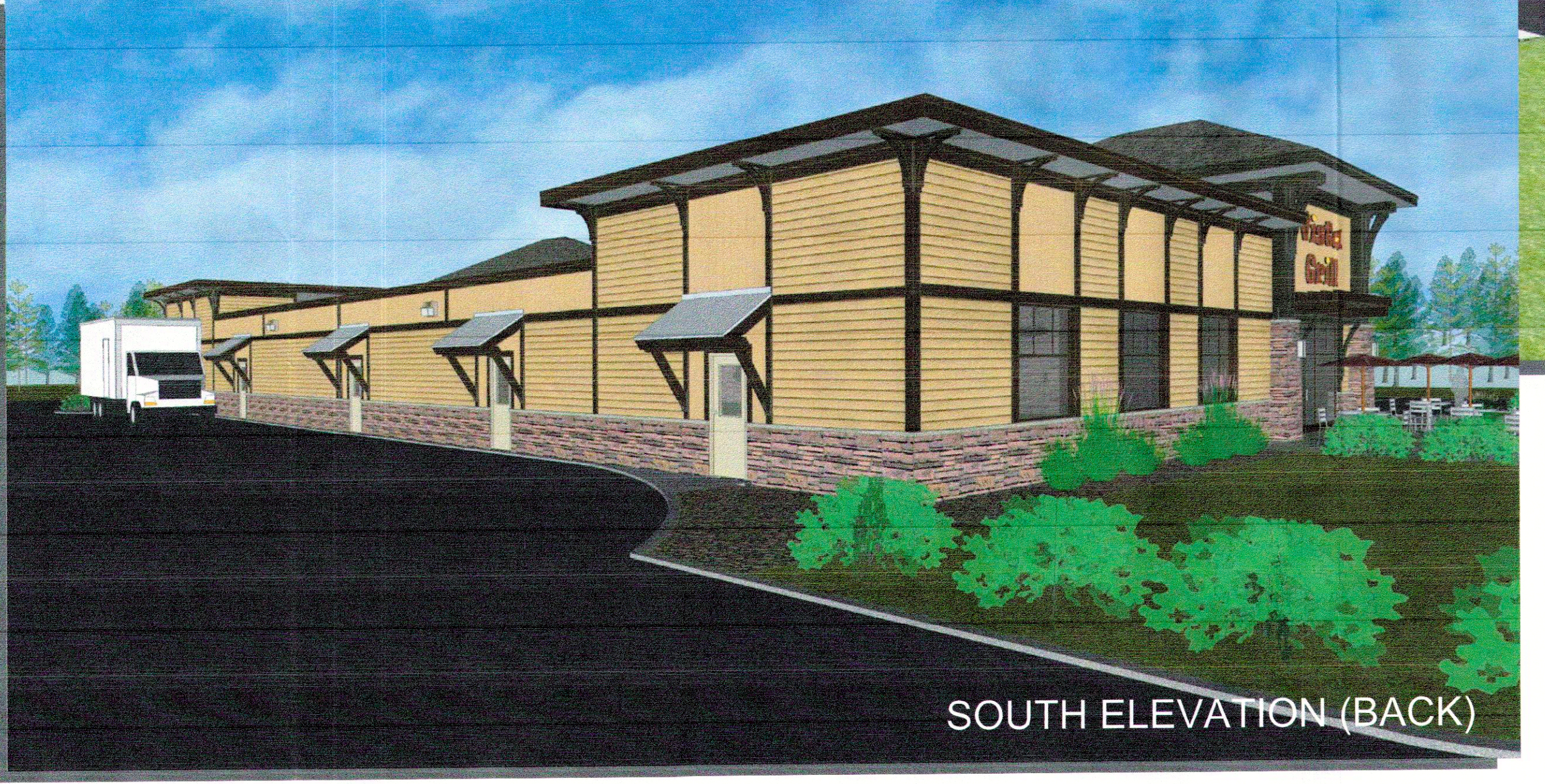
SOUTH ELEVATION (BACK)