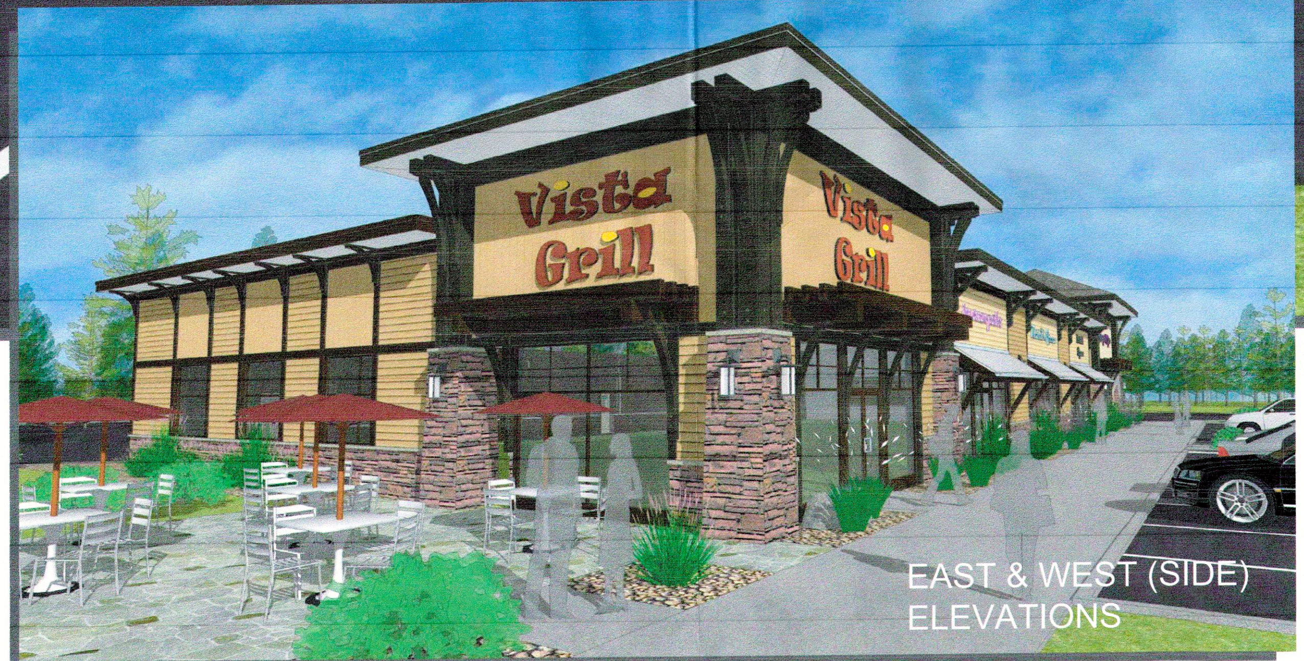
EAST & WEST (SIDE) ELEVATIONS