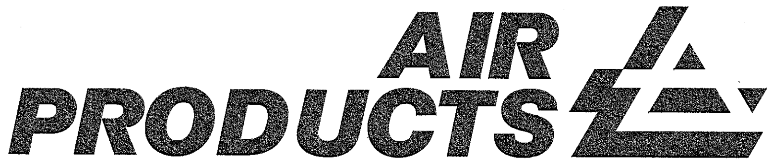
FACILITY SIGN DETAIL - MAIN ENTRANCE

AIR SEPARATION PLANT GLENMONT, NY VISITORS AND DELIVERIES ONLY