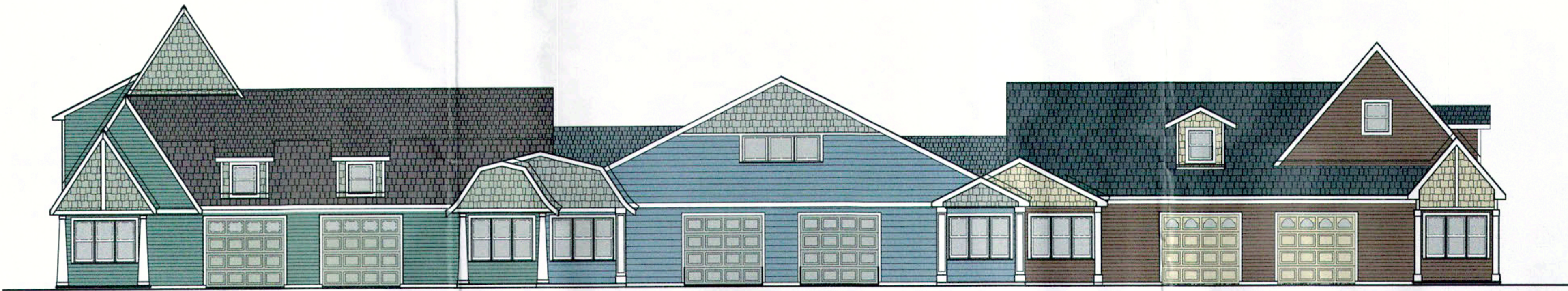
1 BLDG 1 : 6-4.1L FRONT ELEVATION SCALE: 1/8"=1'-0"