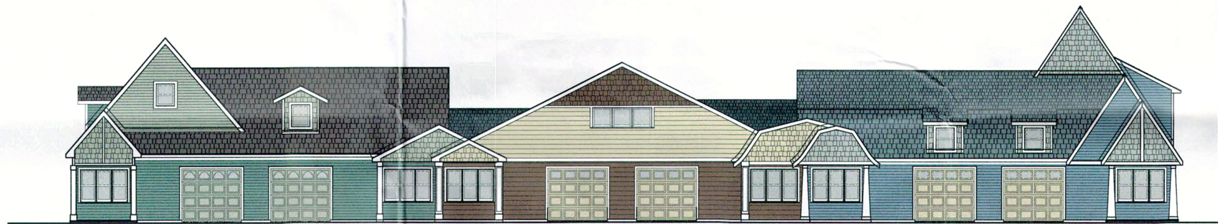
2 BLDG 8 : 6-3.2R FRONT ELEVATION SCALE: 1/8"=1'-0"