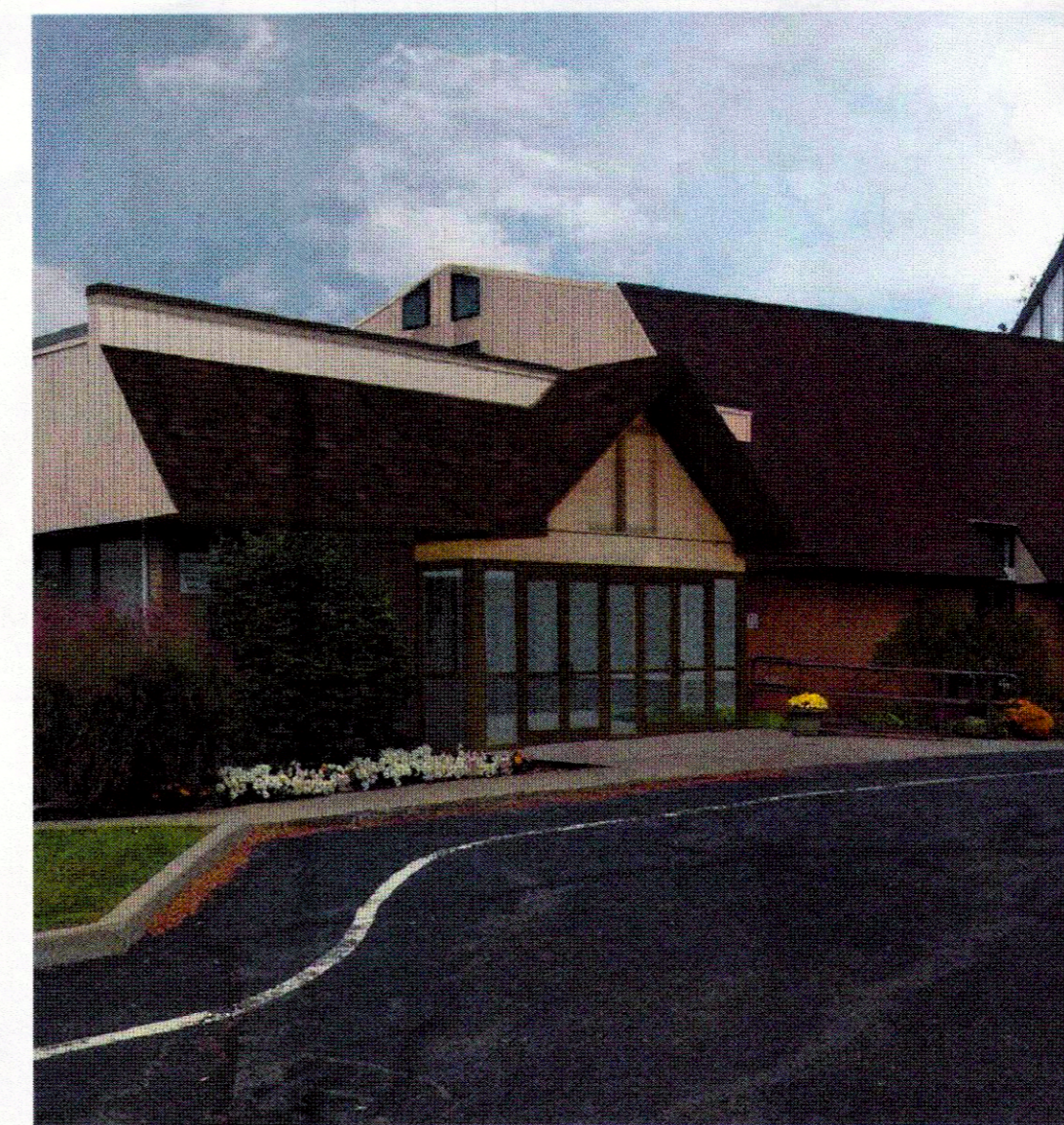
5 FRONT VESTIBULE RENDERING SCALE: N.T.S.

OWNER/APPLICANT Bethlehem Lutheran Church 85 Elm Avenue Delmar, New York 12054