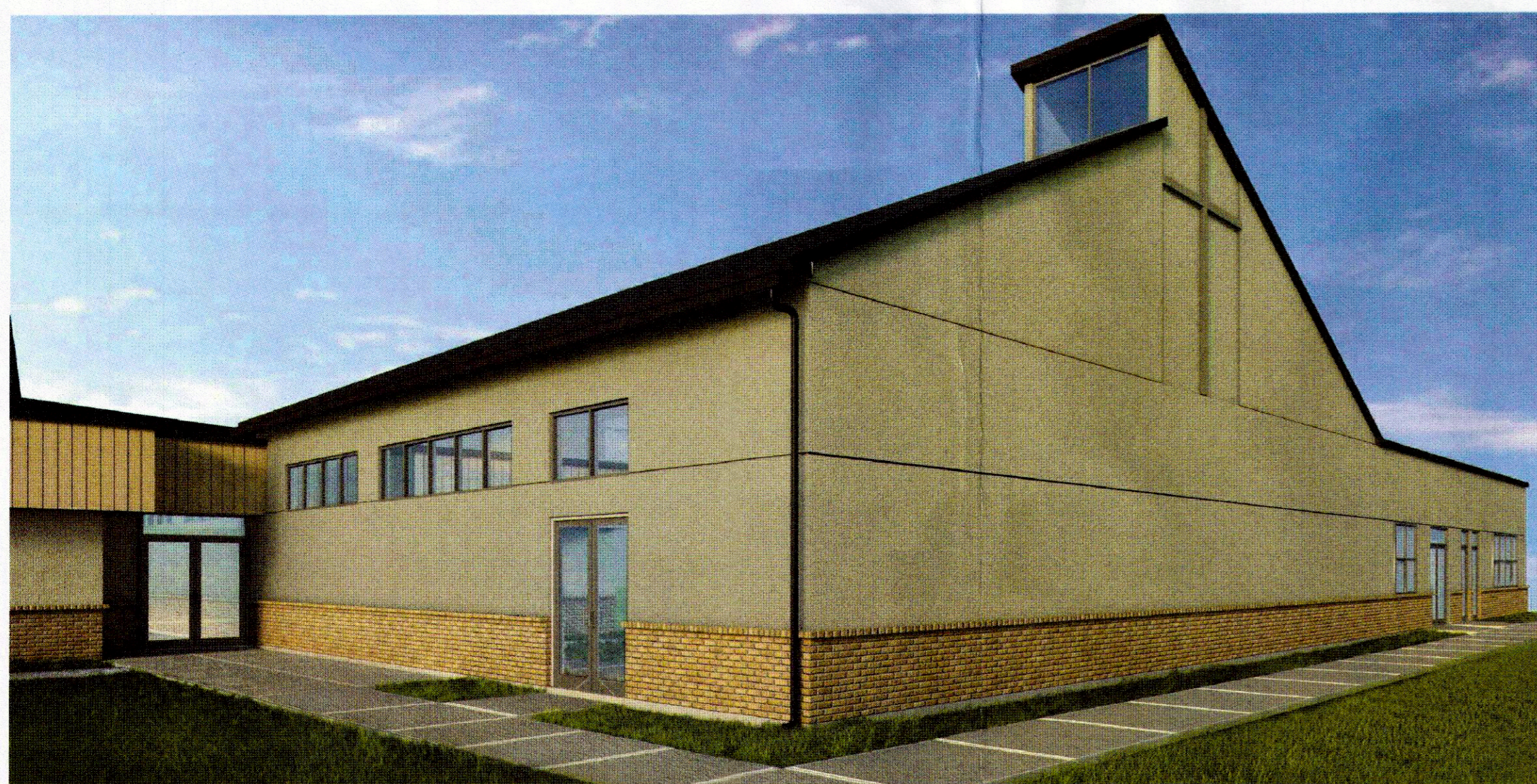
3 WORSHIP AREA RENDERING SCALE: N.T.S.

NOTE: ARCHITECTURE BY: MOSAIC ASSOCIATES ARCHITECTS 2 THIRD STREET, SUITE 440 TROY, NEW YORK 12180