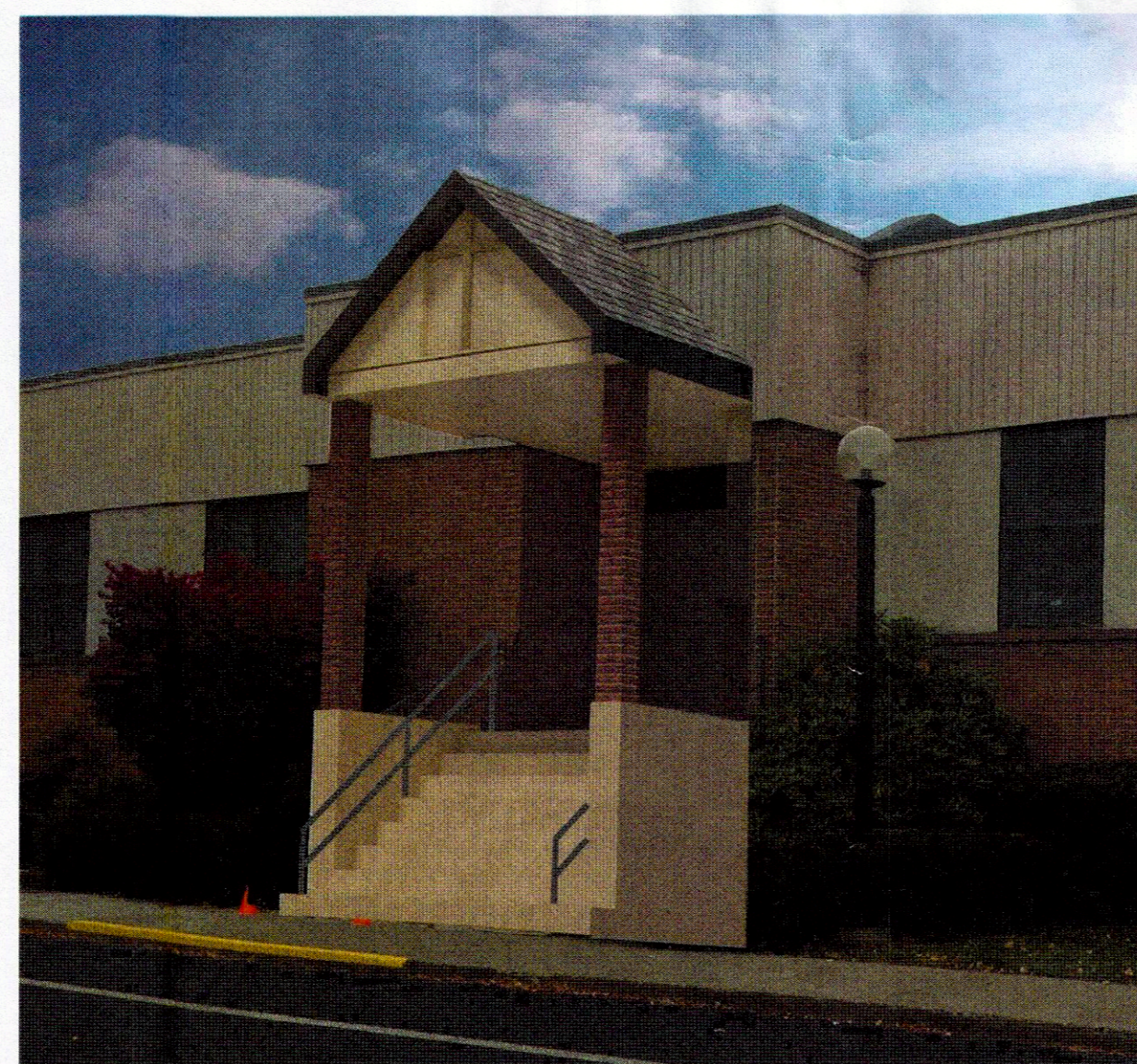
4 COVERED STAIRWAY RENDERING SCALE: N.T.S.