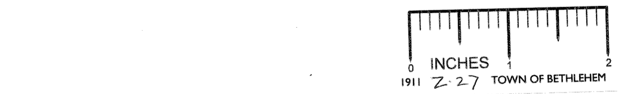
1 ELECTRICAL SITE PLAN - BONDING SCALE: 1"=20'-0"

File: J:\12372\Acad\1204\12372-E-3.dwg User: 1910 7/3/2003